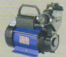
PERIBLOC DELUXE I