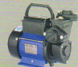
PERIBLOC DELUXE II