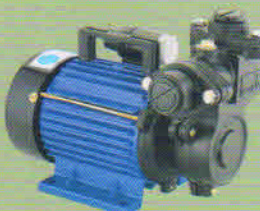
PERIBLOC GX II (CI Version)

KSB – a renowned brand in submersible and Monobloc pump sets for more than 50 years in India – introduces another powerful product: