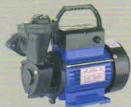
PERIBLOC DELITE II