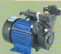
PERIBLOC GX I (CI Version)